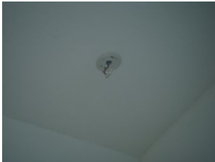
Smoke detectors were missing.