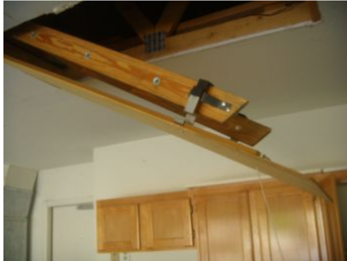
Ladder will not stay against ceiling.