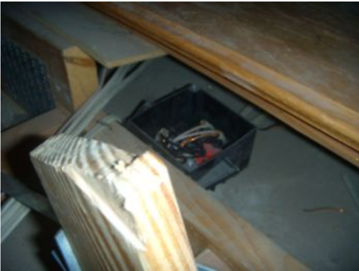
Open junction boxes.