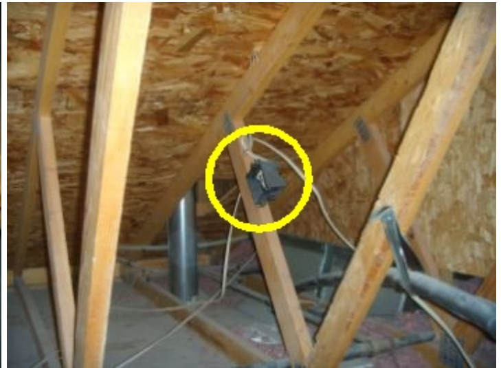
Open junction boxes.