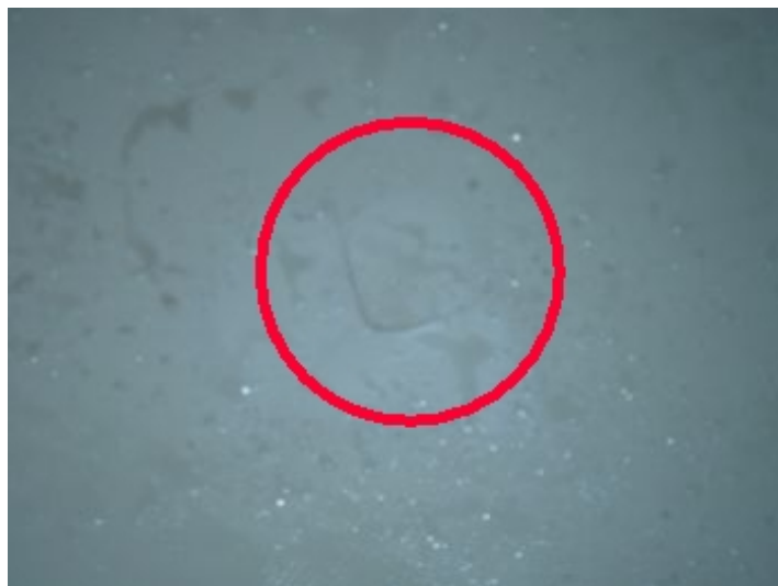
Crack in bottom of bathtub