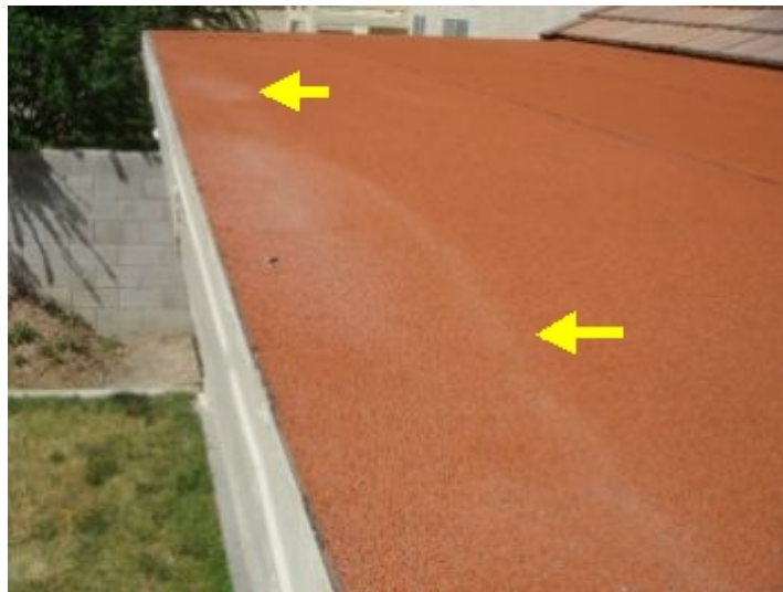
Water pooling on patio roof.