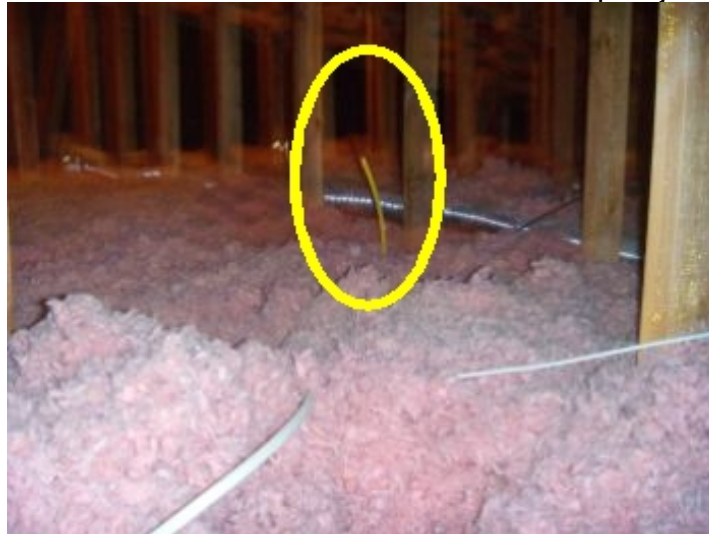
End of wire not in junction box.