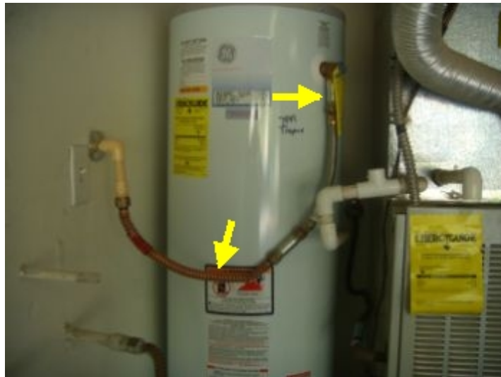
TPRV not to run upwards and not to be trapped.