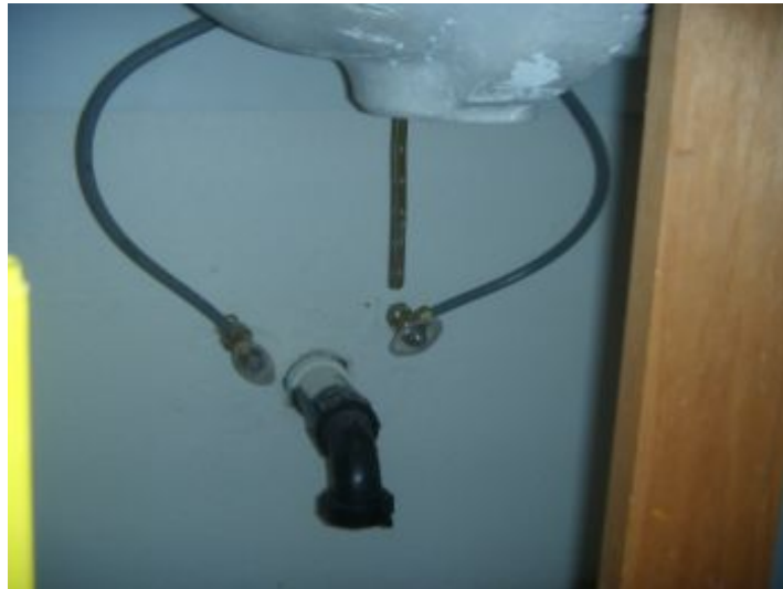
Sink trap not installed.