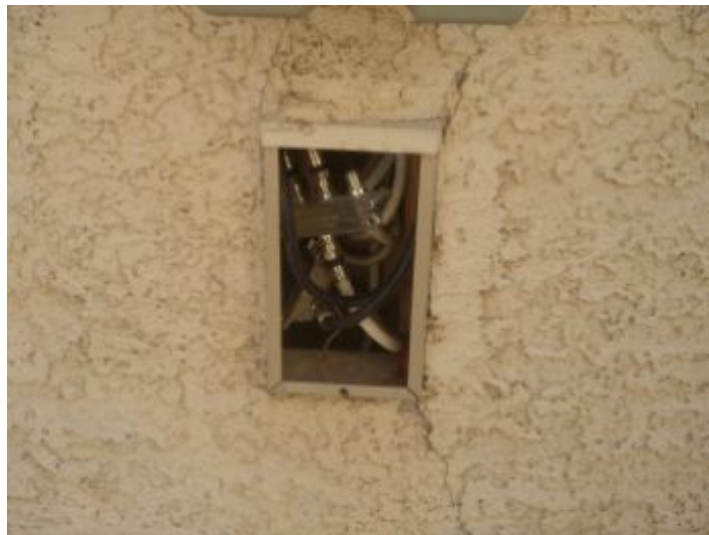
Cable cover missing.