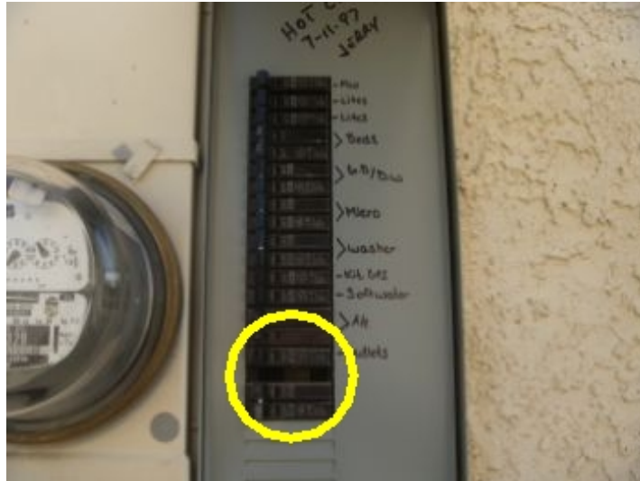
Missing breaker slot.