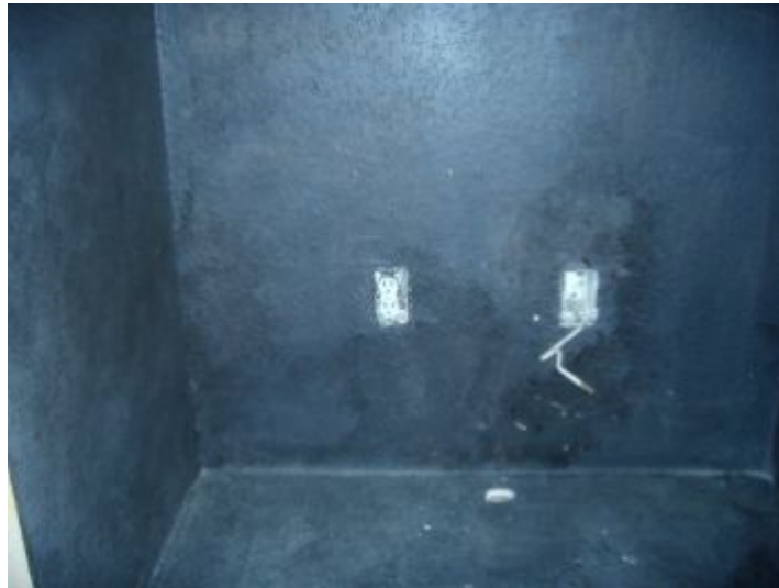
Missing cover plate in TV recess.